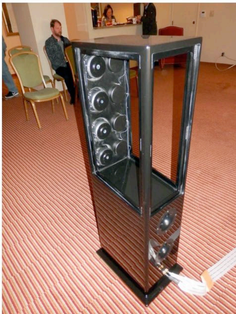
Rear view of the Nola KO2

The KO, and now the KO2, stands as a sort of transitional model in the Nola range -- a model placed at the very top of the firm's 'Boxer' range of speakers, but that is, both conceptually and sonically, quite close to the firm's more costly and exotic 'Reference Gold'-series speakers. Setting the KO2 apart from the original KO are a series of modest changes that together have a big impact on the speaker's sound. Among these changes are new carbon fibre midrange drivers, revised crossover networks, re-tuned low frequency chambers, and more extensive use of Nordost monofilament silver internal wiring. The result is a more open, nuanced, and expansive sound -- areas where the original KO was already very good.