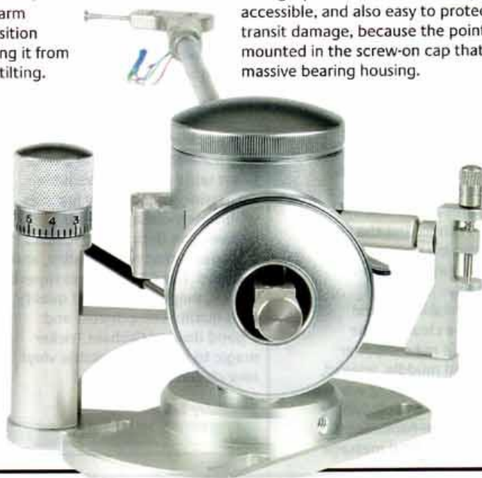
RIGHT: Seen far right is the Magneblade stabiliser, using magnets in line with the arm's pivot point. The outrigger magnet can be moved up or down for azimuth correction

'The E-Go delivers guitar heroics by the bucketload'