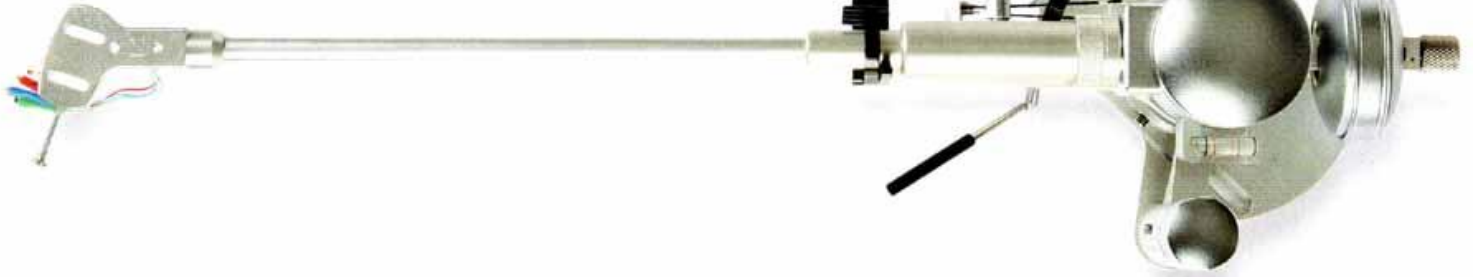
ABOVE: Plan view shows thread-and-weight bias compensator and neat clock-pendulum-shaped counterweight, designed for good operating clearances

However dismissive I may be about Parsons' pipes, the duet on 'Love Hurts' with his muse, Emmylou Harris, is so achingly gorgeous that you begin to appreciate a system's abilities with vocal textures and spacing. The two stand extreme left and right, the instruments filling in the space in-between, but this is not a stereo-circa-1956 ping-pong effect. It simply reflects the song's title by using physical separation to convey the angst of love.