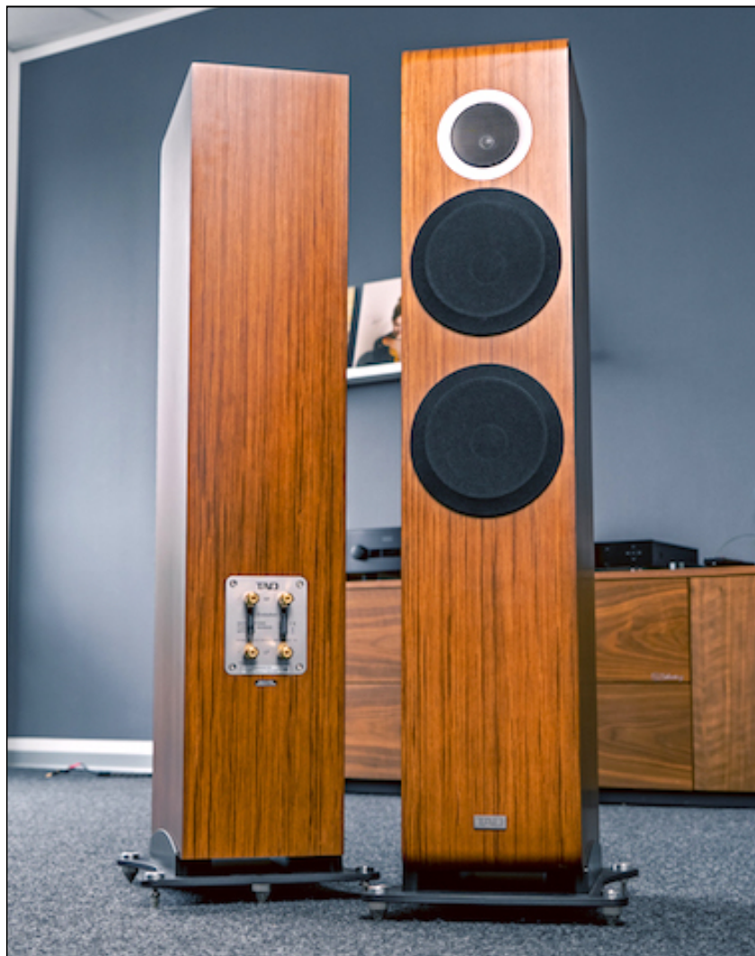
The TAD-E2 from the front and back - and dressed with the supplied covers. The protective covers adhere magnetically, so the housing remains free of recordings.

TAD also puts effort into the crossover hidden in the housing. It takes over the division and assignment of the appropriate frequency ranges to the individual chassis. In principle, this does not happen without influencing the music signal. However, attempts are made to minimize it if possible. TAD therefore uses components of the highest quality with close tolerances. The crossover section for the tweeter and the mid-bass driver are on the same circuit board, but are housed in strictly separate areas. The woofer, on the other hand, is operated with its own crossover. It is also positioned far away in the case. This is to prevent mutual interference. In addition, the crossovers are tuned in such a way that the phase position in the transition areas is optimized. On the other hand, the quality of the connection terminal is visible to us: Here the TAD-E2 offers four high-quality terminals made of solid, gold-plated brass. As always with TAD, the connector panel allows bi-wiring or bi-amping - a mode of operation that is particularly popular in Japan.