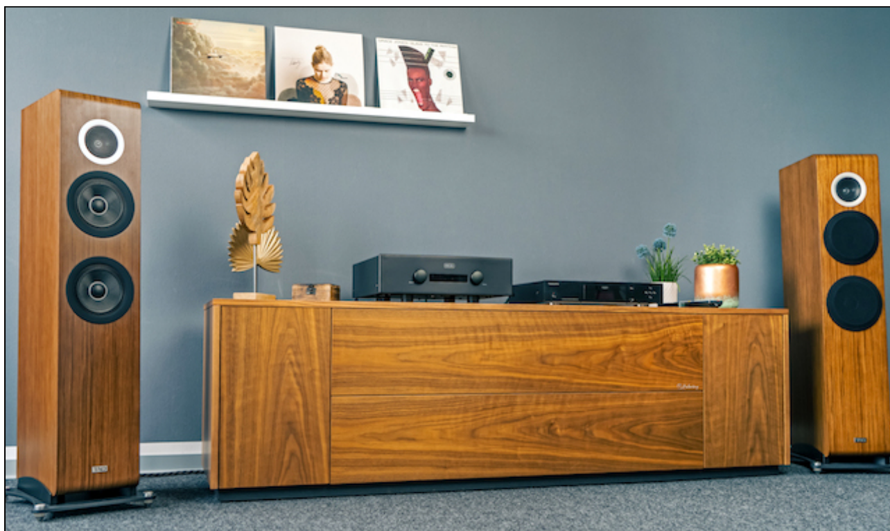
The TAD-E2 in the test room: Here the 2.5-way loudspeaker plays in combination with the SACD player Oppo UDP-203 and the integrated amplifier Hegel H360.

We also experience this feeling of coherence in the further test with a number of other pieces of music, whereby we now pay particular attention to the drums and percussion. Here we notice the precision and accuracy with which the TAD-E2 reproduces the percussion instruments. A prime example is Charly Antolini's "Arabian Desert Groove": This number is a showcase for the grandmaster Antolini and his congenial percussionist Nippy Noya. The two deliver a magnificent complex fireworks display. We enjoy how perfectly the E2 reproduces Antolini's perfectly tuned drum set: The impulse fidelity and the dynamics are terrific, both finely and roughly: We experience how Antolini performs crisp, sparkling runs over the toms, we hear the vital-agile click, when he sometimes only hits the edge of his drums - and we wince, when he effectively delivers individual shots with great taste. The E2 delivers all this in a lifelike, physical way - and remains sovereign, so that listening is a completely relaxed pleasure.