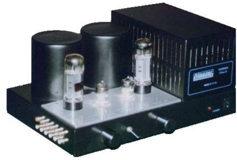
The first amplifier Mastersound (1994)