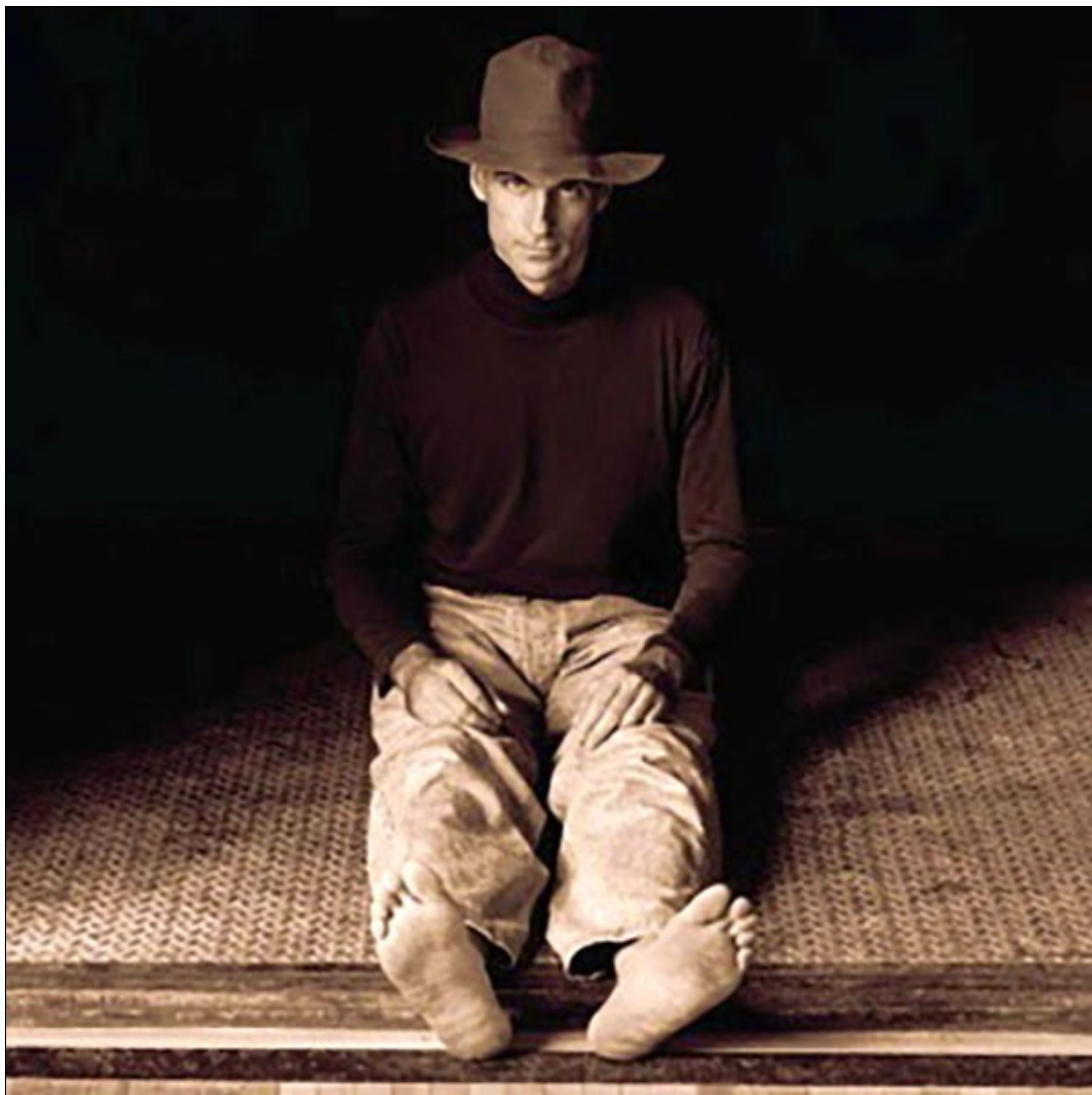
James Taylor "Hourglass"

The remote is basic and when you change inputs, the Flight Three S makes a clicking sound. I felt that the volume control was not granular enough and sometimes I had to get up and adjust the volume knob to get my preferred sound level. A small Phillips screwdriver is included with the remote for opening the back when you change the lithium battery. That was a nice detail! Otherwise, everything else on the back is well labeled and you can see a few module slots for the upgrade process for a DAC or phono input. The Audia Flight Three S has no room correction feature and there is no video output to your TV, so it doesn't take long to set it up and get it going. It worked flawlessly during my review period. Together, I found the AE 320s and Audia Flight made a great match, but the Audia worked well with my Sonus fabers too. There is plenty of juice in the amp to power all but the most inefficient speakers.